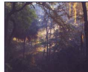
Ocala National Forest

First blazed in 1966, this segment of the Florida Trail is also its most popular, leading backpackers on a weeklong journey through the world's largest scrub habitat, from Clearwater Lake Recreation Area north of Eustis to the Buckman Lock south of Palatka. Several trailheads provide day hikers access to spectacular spots, including the Juniper Prairie Wilderness off SR 40 east of Ocala. A popular loop along the Florida Trail, the Yearling Trail , commemorates the setting of the Marjorie Kinnan Rawlings novel and can be reached from SR 19 south of Salt Springs.