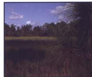
Fakahatchee Strand Preserve State Park

Along the Tamiami Trail east of Naples, the Big Cypress Bend Boardwalk* introduces you to some of the most ancient cypresses you'll ever see, where American bald eagles nest in their canopy above the Fakahatchee Strand. The boardwalk ends at a broad pond within the strand and you must backtrack to the trailhead. Renowned for its diversity of bromeliads and orchids, Fakahatchee Strand Preserve State Park also offers walks on old tramways* leading from Janes Scenic Drive, with guided hikes during the peak of orchid blooms each summer.