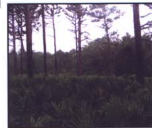
Wekiwa Springs State Park

Surrounding one of Florida's beautiful first magnitude springs just north of Orlando, the hiking trails of Wekiwa Springs State Park offer options for everyone. The gentle Wet to Dry Trail boardwalk slips through the river swamp along the spring to meet the Wekiwa Springs Hiking Trail in the sandhills. The linear White Trail leads to the main wilderness loop where a backpacker's campsite, Camp Cozy, nestles under the cabbage palms along Rock Springs Run.