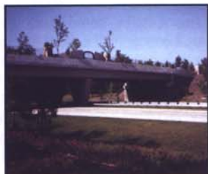
Land Bridge over I-75

This mile-wide corridor across Central Florida was once meant to be a barge canal expediting shipping across the peninsula. Instead, it's been preserved for recreational enjoyment and wildlife habitat where a linear section of the Florida Trail south of Ocala traverses sandhills, pine flatwoods, and steep forested slopes created by the canal building project in the 1930s. The trail offers several primitive campsites and many trailheads. Enjoy day hiking on the Ross Prairie Loop and Land Bridge Loop , which leads to America's first Land Bridge, a wildlife crossing over Interstate 75.