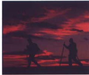
Sunrise along the Florida Trail

Perched atop the Herbert Hoover Dike and passing through quaint towns such as Clewiston and Okeechobee, the Florida Trail provides sweeping vistas of Lake Okeechobee, the second-largest freshwater lake entirely within the borders of the United States. Circling the lake, the Florida Trail has numerous waterfront primitive campsites for backpackers. An overlay on the route, the paved Lake Okeechobee Scenic Trail offers trailhead access points for day hiking from nearby parks.