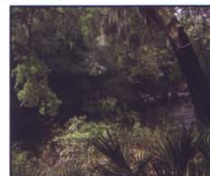
Suwannee River State Park

Suwannee River State Park, west of Live Oak off US 90, has a hiking trail for everyone. The Earthworks Trail leads through defensive earthworks built during the Civil War, and the Sandhills Trail passes through the cemetery of the ghost town of Columbus. The Suwannee River Trail System has several options to enjoy scenic views along the river and its cypress-lined tributary. Backpackers can head out on the Big Oak Trail , which passes a side trail to the historic ruins of a former governor's plantation before it connects with the Florida Trail to lead you to a deeply forested peninsula. The Park is a gateway to outdoor recreation on the Suwannee River Wilderness Trail (SRWT). For more information on SRWT, visit www.floridastateparks.org/wilderness or call (800) 868-9914.