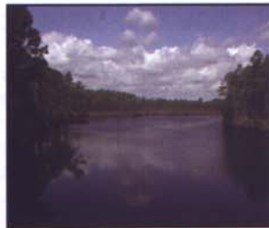
New River in Tate's Hell State Forest

Where the Gulf breezes whisper through the tall pines along the shoreline between Carrabelle and Apalachicola, Tate's Hell State Forest provides an introduction to the coastal pine forests that front the Gulf of Mexico. High Bluffs Coastal Nature Trail loops through dunes covered with scrub plants like Florida rosemary and scrub mint under a canopy of sand pines, and passes within sight of cypress domes. Access the trailhead from US 98 just west of Carrabelle Beach.