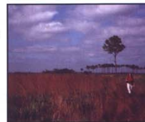
Myakka Hiking Trail

With more than 28,000 acres to roam, hikers at Myakka River State Park near Sarasota have several days worth of backpacking available on the Myakka Hiking Trail , a series of four loops through broad, open prairie edged by cypress domes and oak hammocks, with six primitive campsites along the route. Day hikers can walk the Bee Island