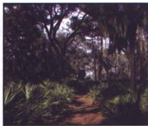
Lake Kissimmee State Park

In one of Florida's best parks for wildlife watching, stretch your legs on four different trails, just west of Winter Haven. The interpretive Flatwoods Pond Nature Trail illustrates habitat succession, while the Buster Island Trail and North Loop Trail enjoy a shady canopy of ancient live oaks for most of their loop, and provide primitive campsites for backpackers. The Gobbler Ridge Trail is a spur through open scrub and prairie to the marshy fringe of Lake Kissimmee.