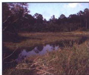
Bulow Creek Wetlands

Following the winding course of Bulow Creek, this trail connects two sites important to Florida's history. At Bulow Plantation Ruins Historic State Park, explore the ruins of an 1831 sugar mill on the Sugar Mill Trail . The Bulow Creek Hiking Trail runs south from the park and provides a day-hike loop option, the Bulow Creek Loop , through old growth forest. If you continue south into Bulow Creek State Park past Boardman Pond, a side trail leads to a backpacker's campsite, and the main trail ends at the Fairchild Oak, a gargantuan tree thought to be 2,000 years old or more, where the Wahlin Trail loops around a spring. Both parks are off I-95 between Flagler Beach and Ormond Beach.