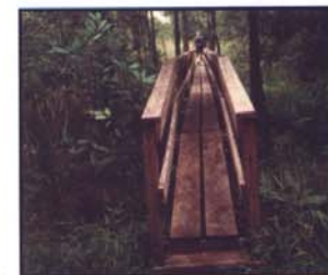
Little-Big Econ State Forest

Named one of the nation's top family-friendly trails by the American Hiking Society, a linear section of the Florida Trail along the Econlockhatchee River east of Orlando provides scenic views from the bluffs high above this tributary of the St. Johns River, crossing numerous bridges over steep ravines. Trailheads are at Barr Street (SR 426) in Oviedo and Snowhill Road in Chuluota.